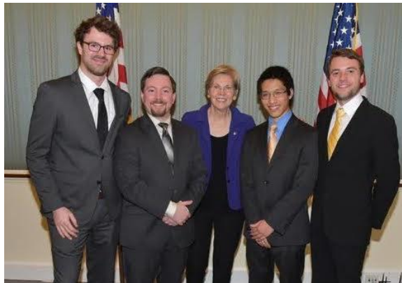
The MIT GSC Delegation with Senator Elizabeth Warren in March 2016