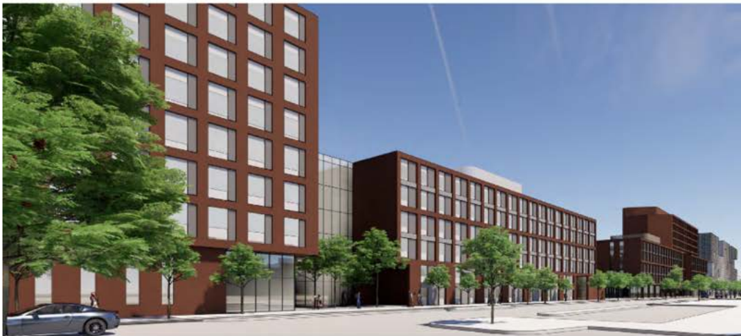
VASSAR WEST COURTYARD