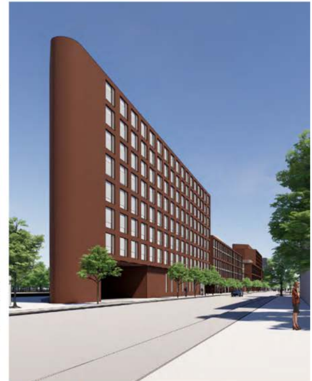
VASSAR LOOKING EAST

WEST BUILDING MIT WEST CAMPUS GRADUATE DORMITORY PROJECT